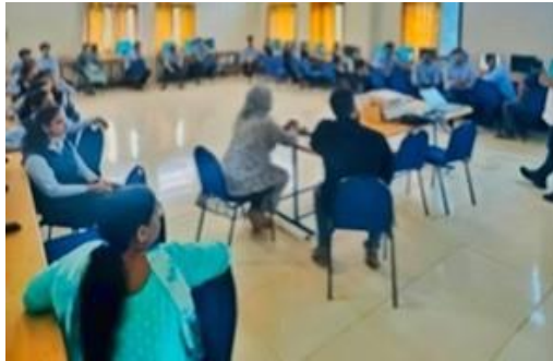
Snapshot on Skill Development Program