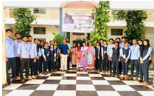
Students and staffs participated in BIM Workshop

This training program aimed to equip students with the knowledge and skills required to use Building Information Modelling (BIM) software, which is widely used in the construction industry. By conducting this program, the Department of Civil Engineering and 'SATTVA' have taken a significant step towards bridging the gap between academic learning and industry.