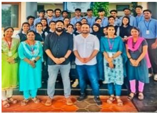
Students and staffs participated in Skill Development Program