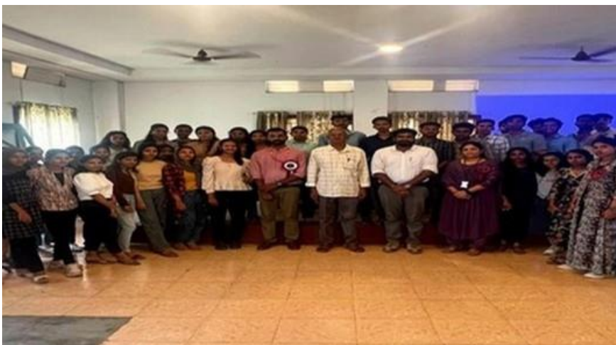
Group photo of participants and staffs