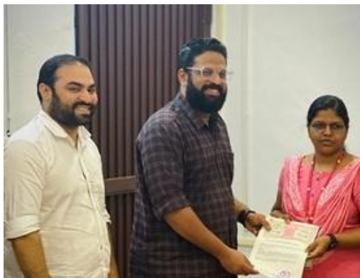
St. Thomas College of Engineering & Technology has signed an MoU with CBG