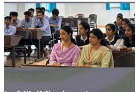
EXPERT TALK CONDUCTED ON TOPIC EMERGING TRENDS IN WATER AND WASTEWATER MANAGEMENT